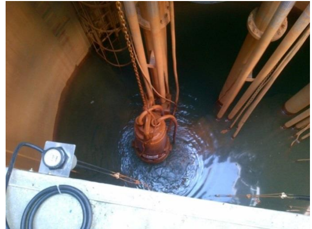
Projek Perintis Penggunaan Kaedah Penapisan Tebing Sungai (River Bank Filtration) di Loji Kota Lama Kiri, Kuala Kangsar