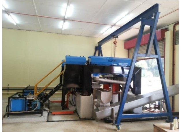
Package 2: Construction And Completion of Sg. Sayong Sludge Treatment Facility And Associated Works