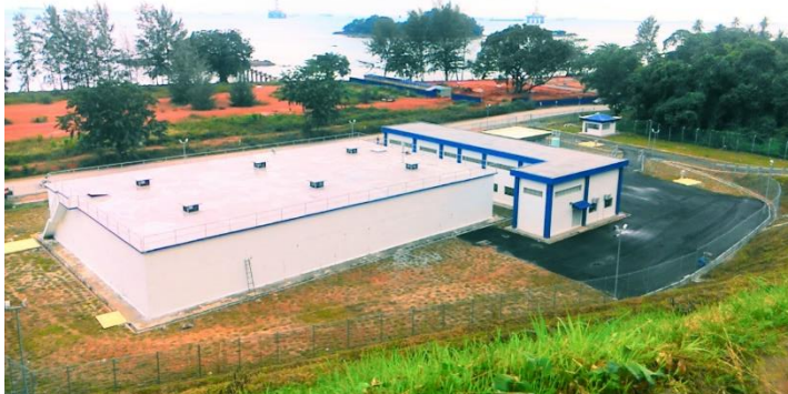
Package 3: Construction and Completion of Distribution Improvement Works at Sg Rengit/ Pengerang and Associated Works