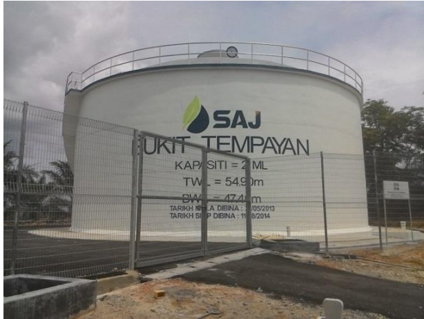
Package 1 - Construction And Completion of 2 ML Bukit Tempayan Reservoir And Associated Works

Proposed Sg. Rengit/Pengerang Distribution Improvement, Sg. Sayong Sludge Treatment Facility and Rehabilitation of Bukit Tempayan Reservoir, Batu Pahat.