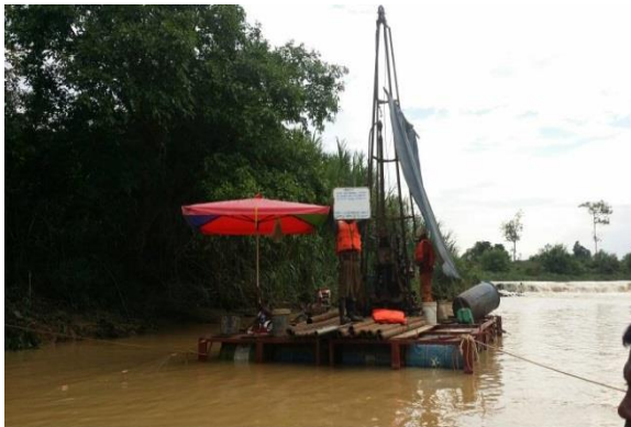
Kerja-kerja Meningkatkan Sumber Air Mentah Di Loji Rawatan Air Gemas