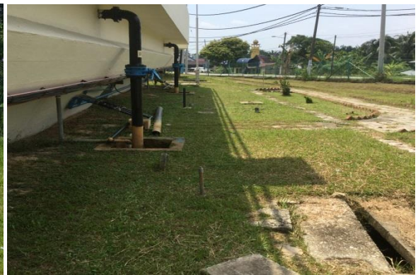
Conceptual Study Untuk Sludge Dewatering Facility Bagi Loji Rawatan Air Gunung Semanggol Rancangan Bekalan Air Daerah Larut Matang, Selama dan Kerian