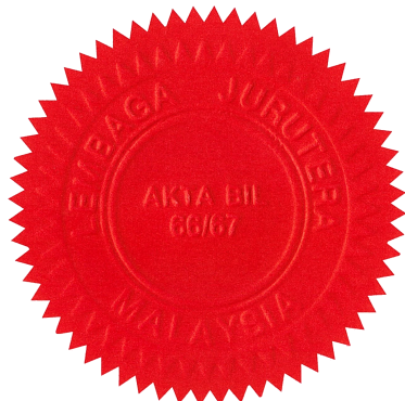
(Ir. KAMALUDDIN BIN HAJI ABDUL RASHID) Yang Dipertua

Perakuan pendaftaran ini akan habis tempoh pada 31 Disember 2020