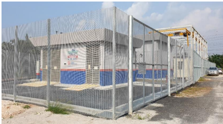
Sg. Labu & Sg. Langat Intakes, Pump Stations, Piping System for Raw Water and Effluent Discharge and Associated Works