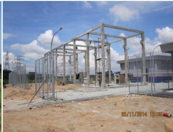
Sg. Labu & Sg. Langat Intakes, Pump Stations, Piping System for Raw Water and Effluent Discharge and Associated Works