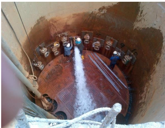
Projek Perintis Penggunaan Kaedah Penapisan Tebing Sungai (River Bank Filtration) di Loji Kota Lama Kiri, Kuala Kangsar