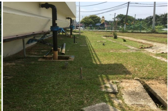
Conceptual Study Untuk Sludge Dewatering Facility Bagi Loji Rawatan Air Gunung Semanggol Rancangan Bekalan Air Daerah Larut Matang, Selama dan Kerian