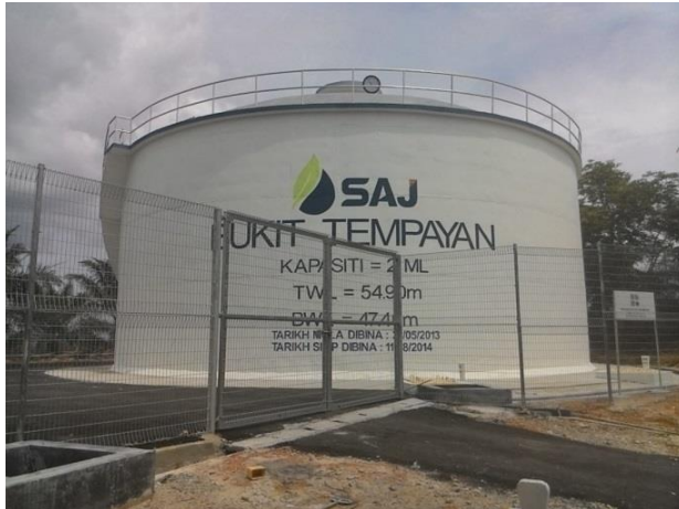
Package 1 - Construction And Completion of 2 ML Bukit Tempayan Reservoir And Associated Works

Proposed Sg. Rengit/Pengerang Distribution Improvement, Sg. Sayong Sludge Treatment Facility and Rehabilitation of Bukit Tempayan Reservoir, Batu Pahat.