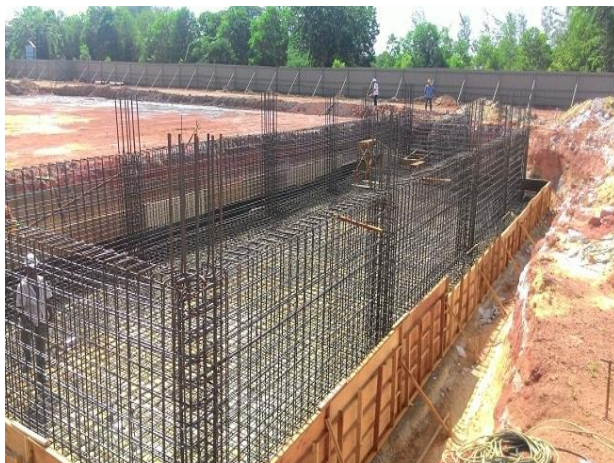
Package 3: Construction and Completion of Distribution Improvement Works at Sg Rengit/ Pengerang and Associated Works