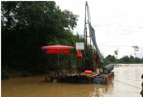
Kerja-kerja Meningkatkan Sumber Air Mentah Di Loji Rawatan Air Gemas